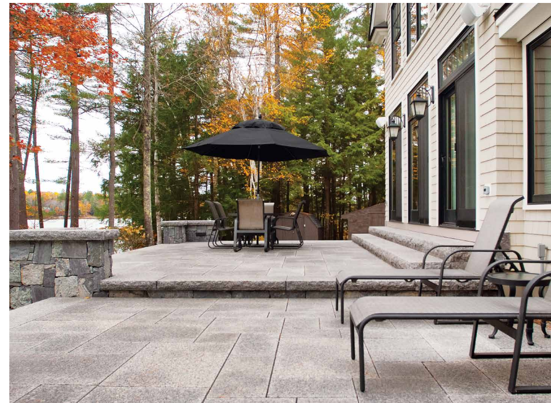
pictured here: Caledonia granite steps, treads, pavers and cap, Corinthian granite square and rectangular veneer