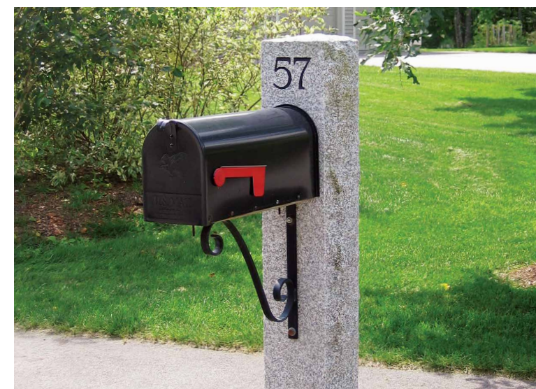
pictured here: engraved Woodbury Gray granite mailbox post