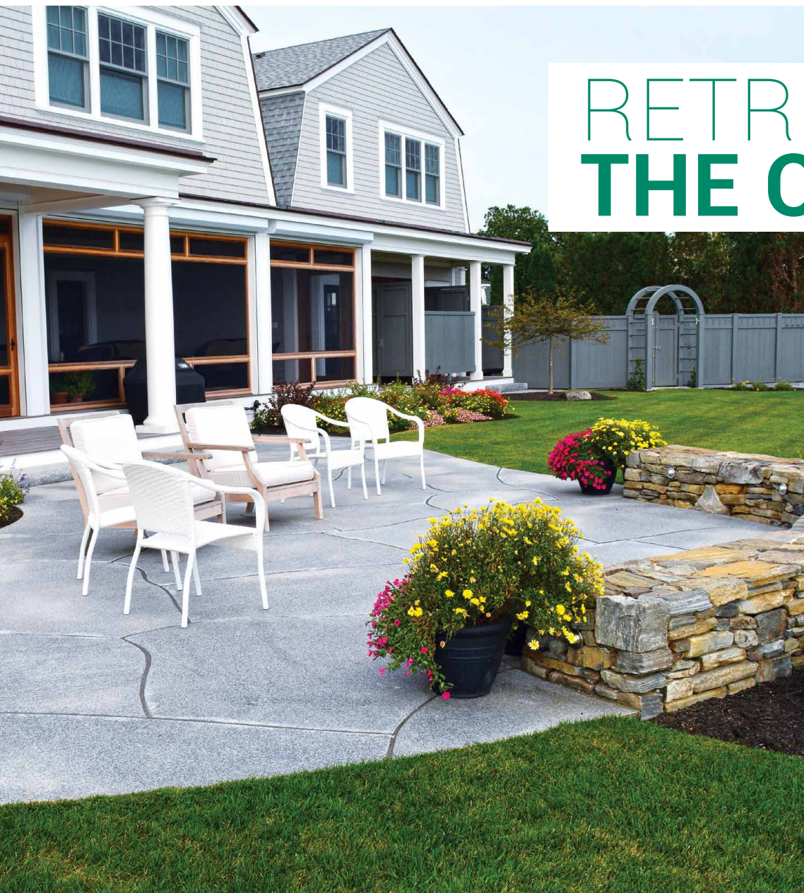
pictured here: custom irregular Woodbury Gray granite flagging, Weathered Mountain Stone