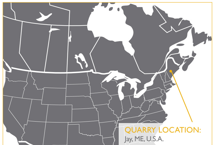
QUARRY LOCATION: Jay, ME, U.S.A.